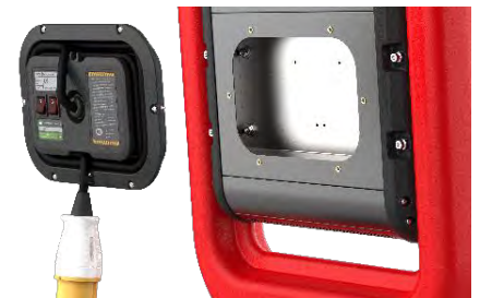
Quick access panel for maintenance