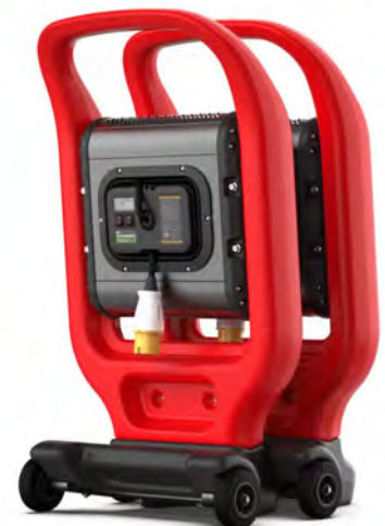
Nesting, space saving design