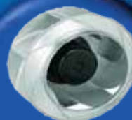
HIGH CAPACITY EC FAN