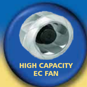
HIGH CAPACITY EC FAN