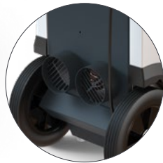
AD 935 S with 1kW electric heating element and 2x Ø100mm duct connections