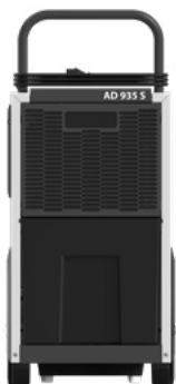
AD 935 S

The AD 9 series is a game-changer in condensation dehumidification technology that combines cutting-edge performance features with customisable and eco-friendly solutions. With a focus on user convenience, the range of condensation dehumidifiers boasts a standardised and proven design combined with a user-friendly CC6 control panel that allows for wireless connectivity with Dantherm Group's remote monitoring system Simplify. Engineered for longevity, the AD 9 series simplifies maintenance and ensures hassle-free operation in various professional drying applications.